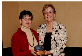
Friends of Cherry Valley

Six categories of awards were presented during the ceremony, to individuals, community organizations, and businesses alike. Those awards and award winners were: