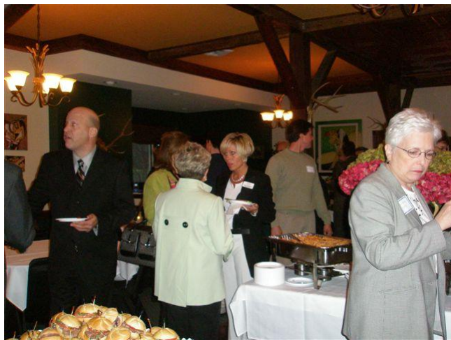
Business Card Exchange at Creek Club Grille at Cherry Valley Golf Course

Creek Club Grille at Cherry Valley Golf Course hosted the April 6th Business Card Exchange. What a beautiful view from the restaurant, which overlooks the golf course. They offered a delicious array of food, both hot and cold for everyone to sample. If you are interested in playing a round of golf or just to dine, call them today at 570-421-1350.