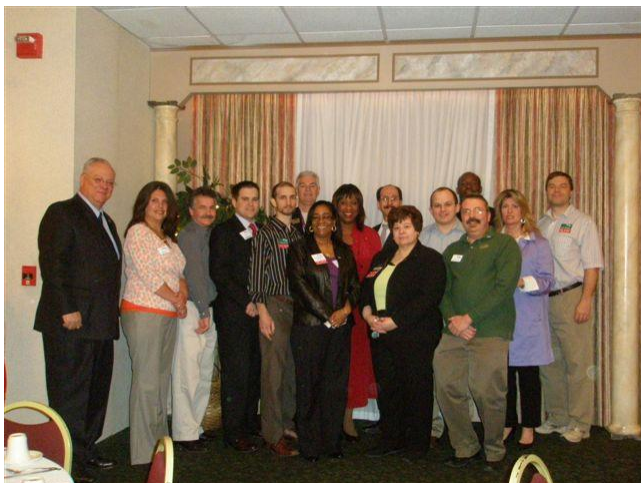
LeTip of Stroudsburg

LeTip is the oldest networking organization and they have an excellent core group in this area. Networking is about giving. To make a business out of an opportunity takes drive and networking is vital to your business.