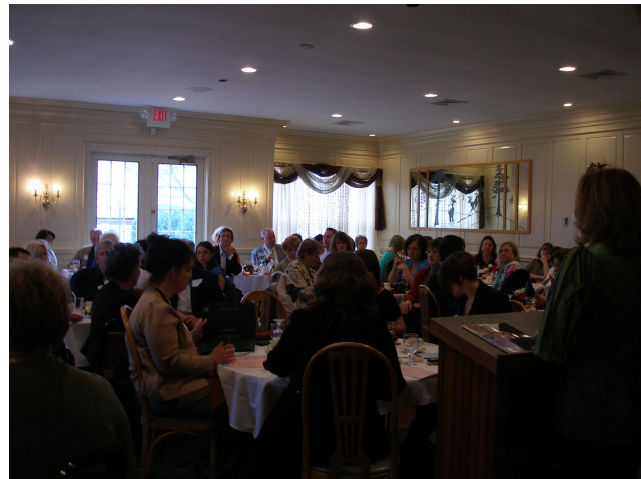
April Women in Business Luncheon at Big A Grillehouse

The April Women in Business luncheon, which was held at the Big A Grillehouse, featured the annual Save Our Planet Awards presentation. Each year, the Environmental Committee recognizes individuals and companies that have shown outstanding or innovative environmental contributions in our area. (See story on front cover).